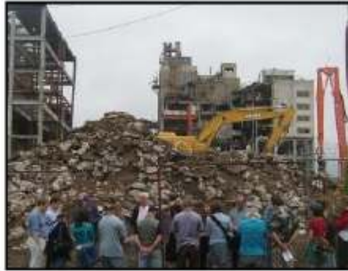
Above: After an emotional environmental justice tour, the group gathers for prayer.

Subsidies for the Environmental Justice Tour provided by the Drew Theological School's student organization, TERRA (Transforming Environmental Religious Resources Into Action)