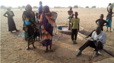
Photo: Hygiene Promoters on a home visit to promote health hygiene messages in Khazan Jadeed located in Sheria Locality in East Darfur.

On April 29 , there will be extra envelopes to receive whatever gifts you would like to make to this important relief ministry. Or you can text 'umcorsunday' to 91999 and give from your cellphone.